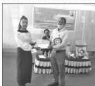
CHRONICLE NEWS SERVICE

(IMPRA): Nehru Yuvak Kendra (NYK) Thoubal in collaboration with PHED and Thoubal district administration conducted declamation contest on the topic 'rainwater harvesting (catch the rain where it falls)' on Tuesday at Counting Hall DC Thoubal Complex as a part of Neighbourhood Youth Parliament programme of NYK Thoubal.