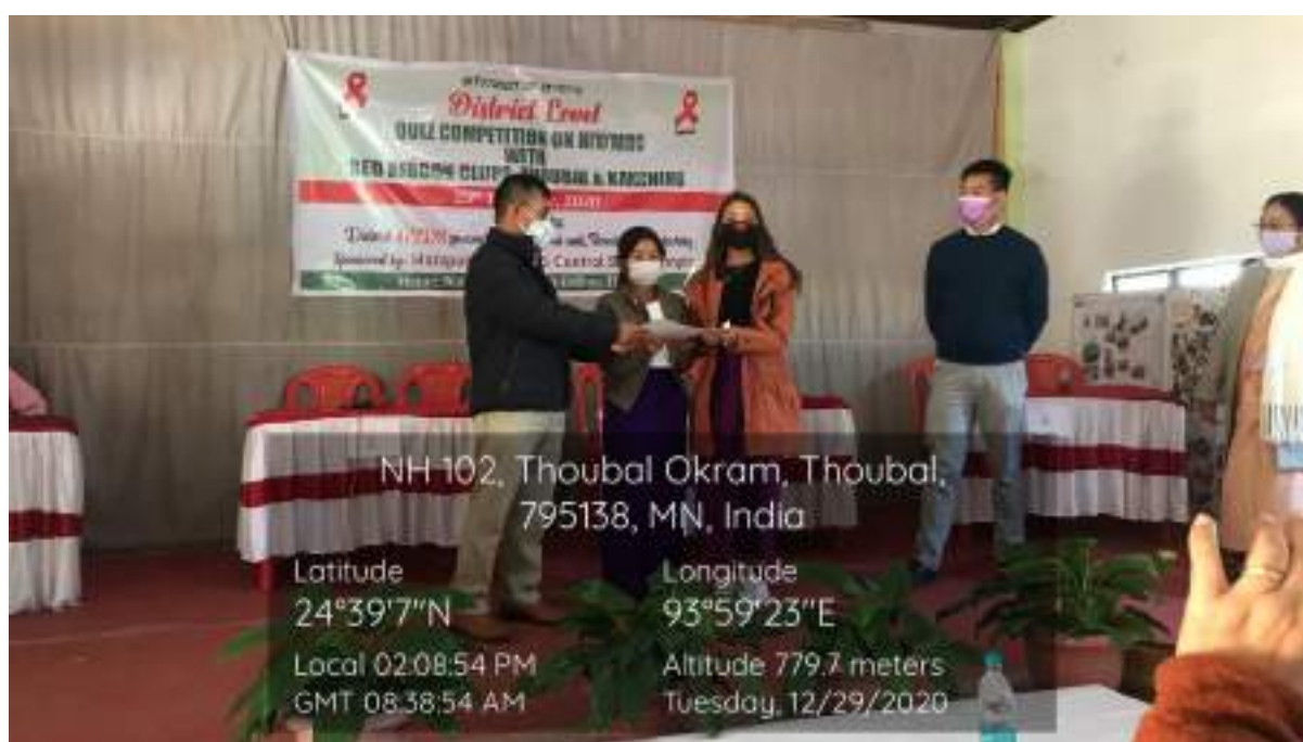
DACO Presenting the Cash Prize and Certificate to the 3 rd Prize Winners.